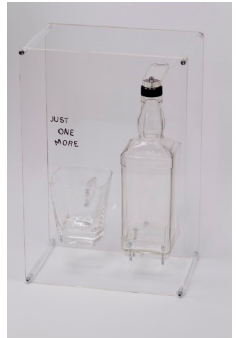
JUST ONE MORE Part of FRAGILE (2017) 2017