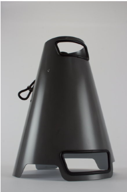
GENIO Multifunction lamp for every home 2018

My interests vary from conceptual art to physical science such as engineering. Most of my current work is formed around the human, its body and its interaction with the surrounding world, such as my first solo exhibition "The World As We Know It" held at the European Court of Justice (Luxembourg).